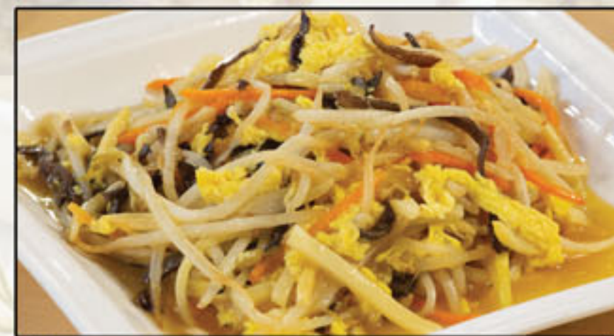
芙蓉素燴 Mixed vegetables with egg