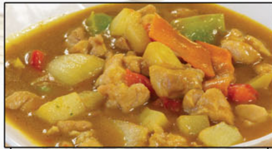
咖喱雞 Curry chicken