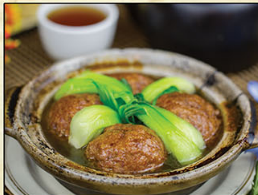
砂鍋獅子頭 $15.99 Shanghai meat balls