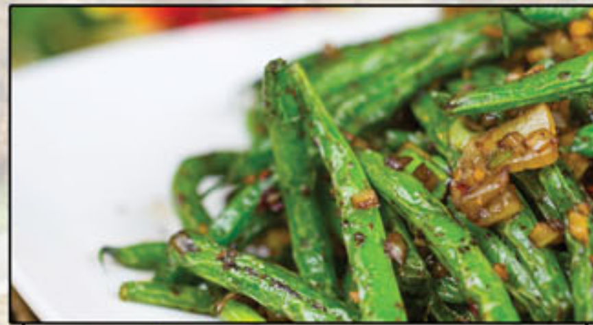
🌶️ 干煸四季豆 Szechwan style fried green bean