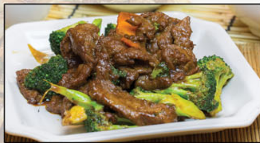
百加利牛肉 Beef with broccoli