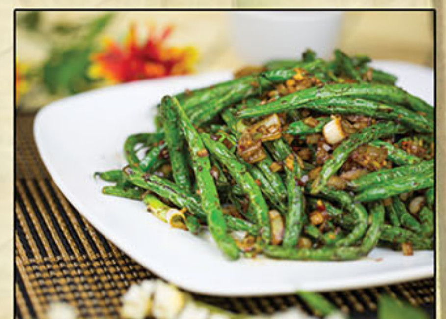
干煸四季豆 $13.59 Szechwan style fried green bean