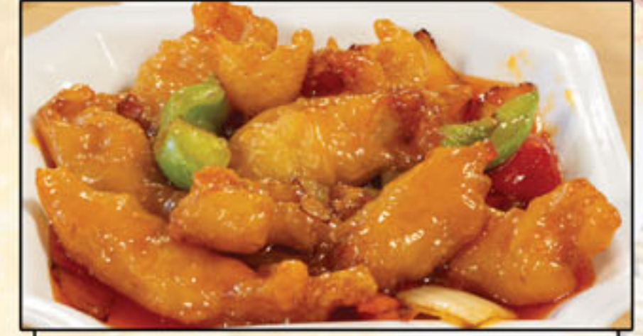
咕嚕魚 Sweet and sour fish