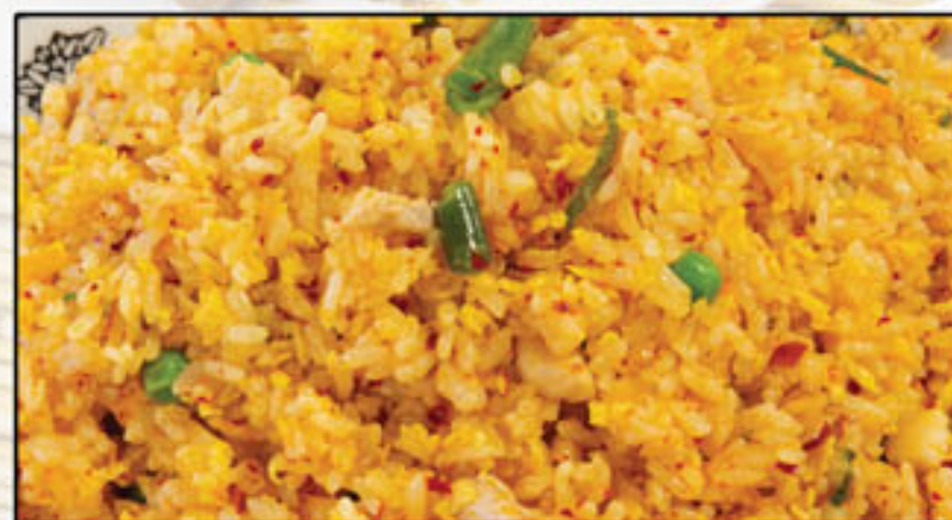
🌶️ 四川炒飯 Szechwan style fried rice $11.99