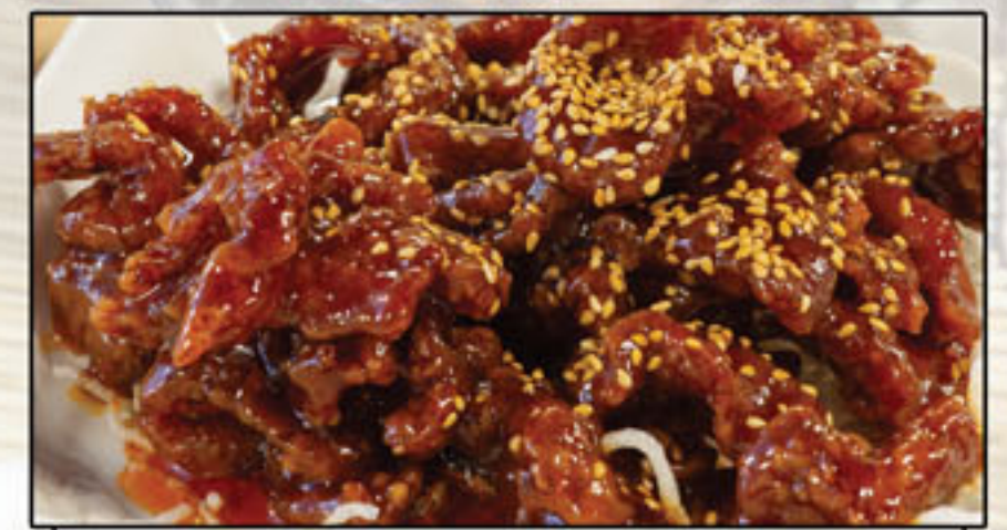
芝麻牛肉 Sesame beef