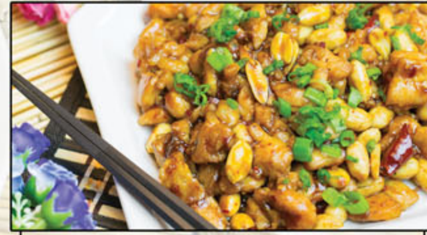
宮保雞丁 Kungpao chicken with peanuts