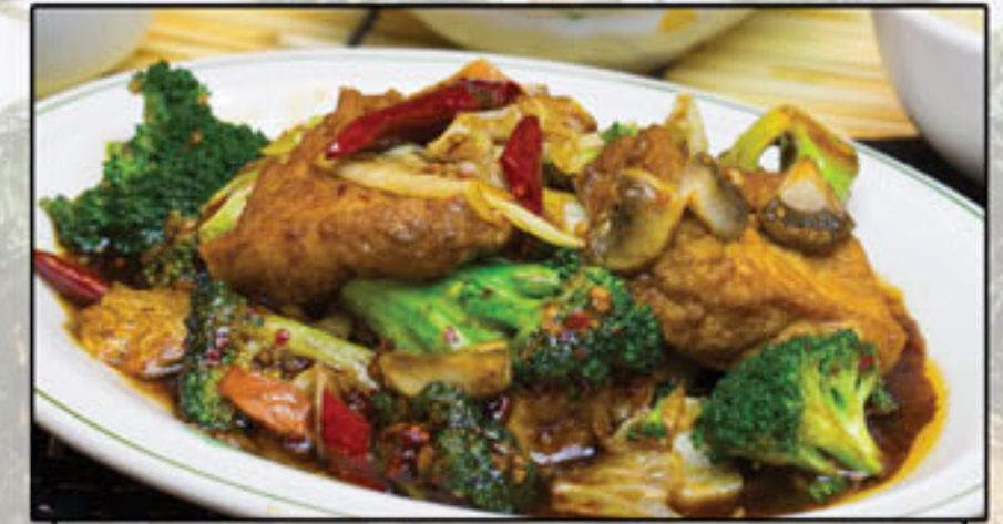
🌶️ 四川豆腐 Vegetables and tofu Szechwan style