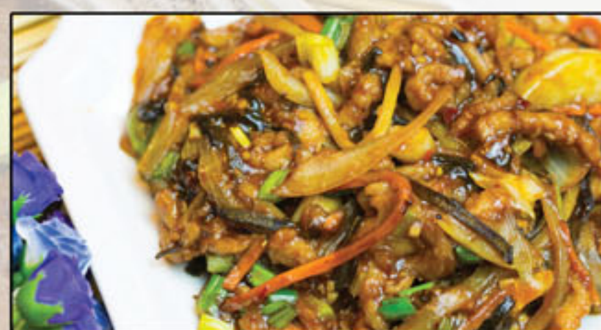
魚香肉絲 Shredded pork with chili and garlic sauce

請注意食物包含麵筋，堅果或其他致敏物。 如閣下對任何食品有過敏或關注，請告知服務員。謝謝！ Food prepared here contains gluten, nuts or other allergens. Please speak to your server if you have any special dietary requirements or concern. Thank you!