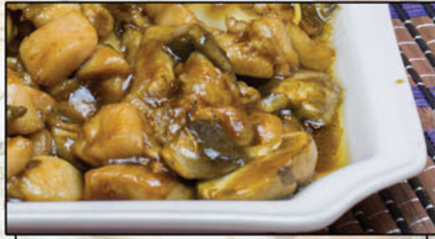
蘑菇雞 Chicken with mushroom

以下餐加蔬菜或肉 +$4.00 Add vegetables or meat to below items