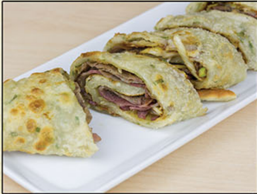
牛肉卷餅 $7.49 Pan-fried cake with marinated beef