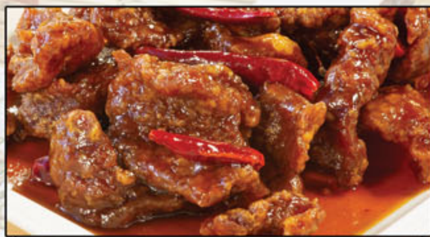
陳皮牛肉 Orange peel beef