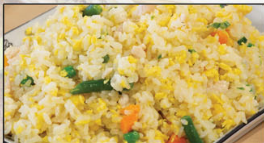
雞炒飯 Chicken fried rice $11.99