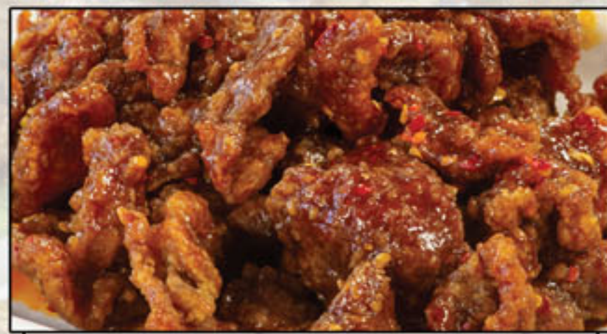
辣薑煸牛肉 Ginger beef with chili sauce