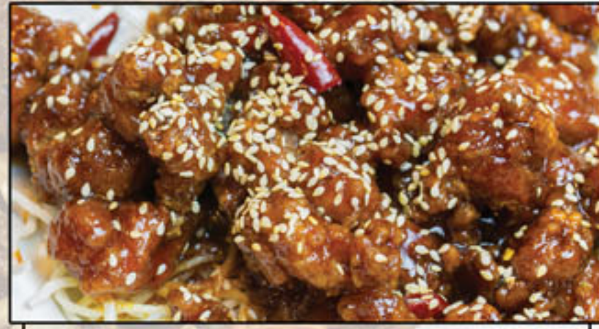
芝麻雞 Sesame chicken