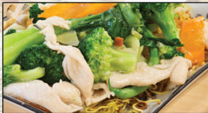
雞炒麵 Chicken chow mein $11.99