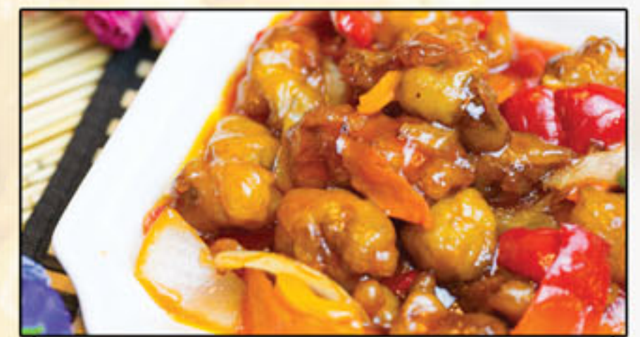
咕嚕肉 Sweet and sour pork