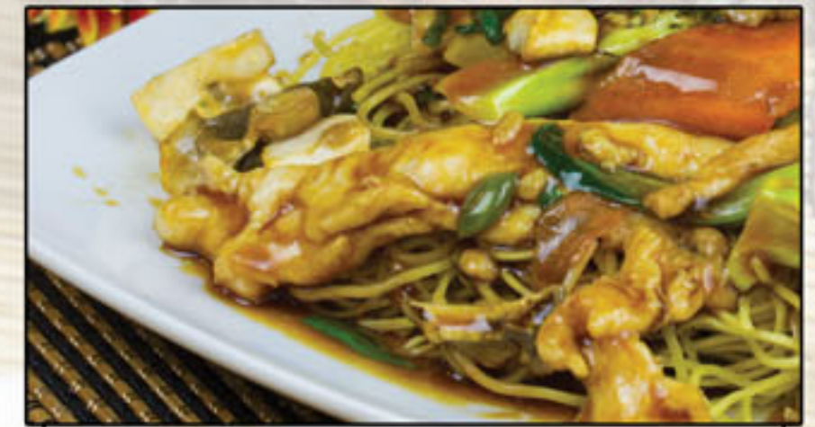
招牌炒麵 House special chow mein $11.99