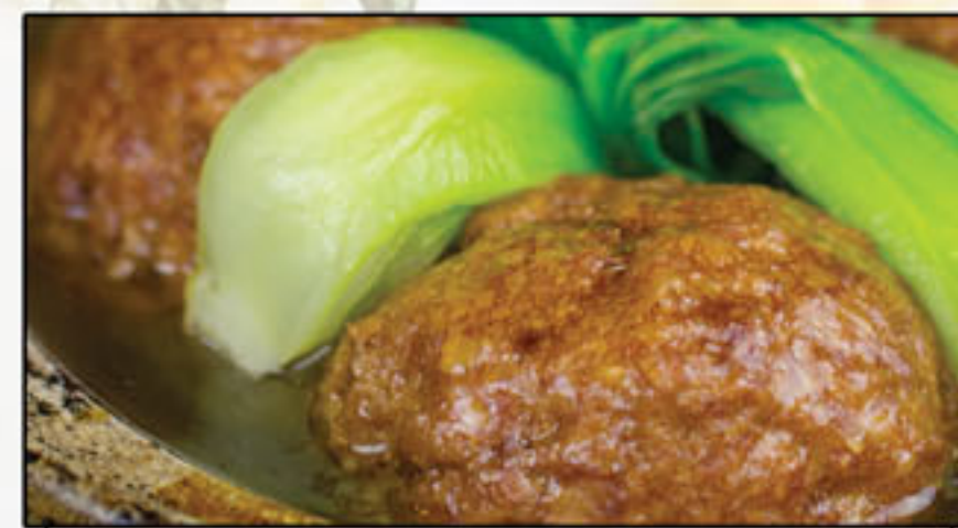
獅子頭 Shanghai meat balls