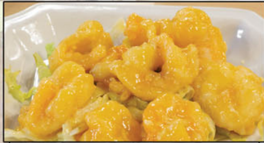
蜜汁蝦 Honey prawns