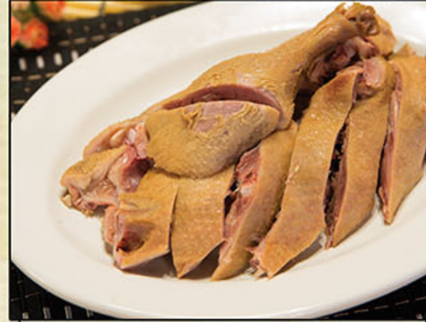
古法滷鴨 $18.99 Braised duck