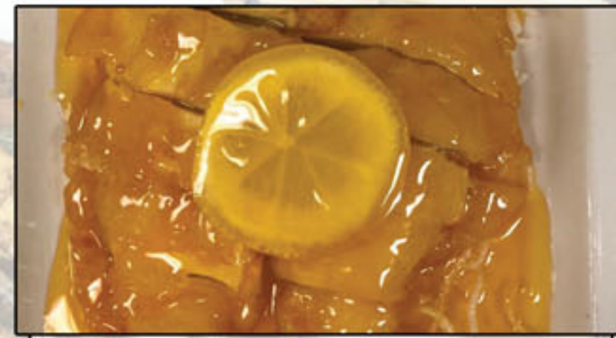
檸檬雞 Lemon chicken