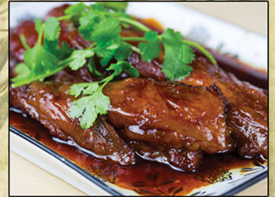
無錫排骨 $16.99 Braised pork