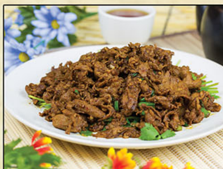
孜然羊肉 $18.99 Lamb with cumin