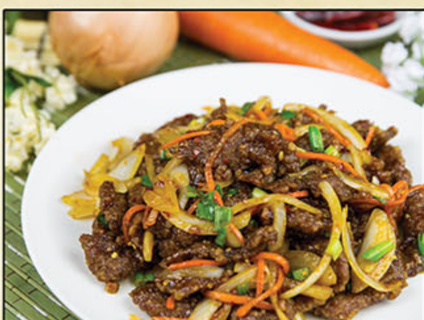
薑煸牛肉 $16.49 Ginger beef