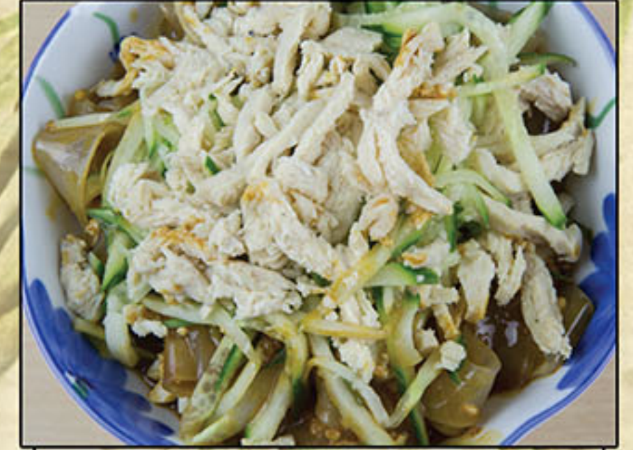
涼拌粉皮 $10.99 Beijing style chicken fenpi (mungbean pasta) salad