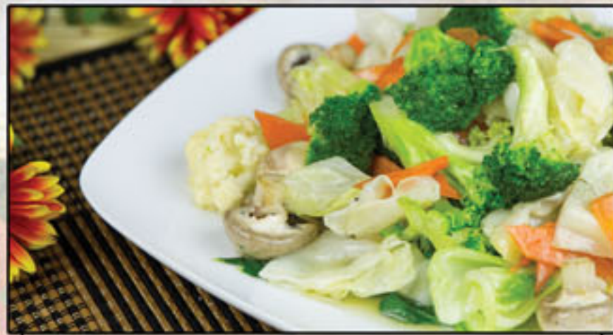
成都素燴 Deluxe mixed vegetables