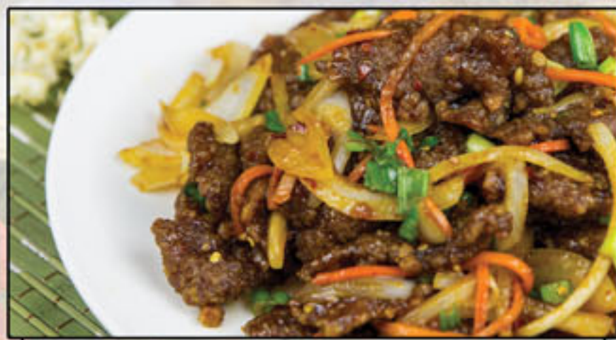
薑煸牛肉 Ginger beef