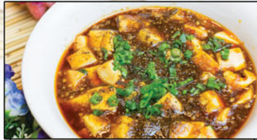
🌶️ 麻婆豆腐 Spicy ma-po tofu