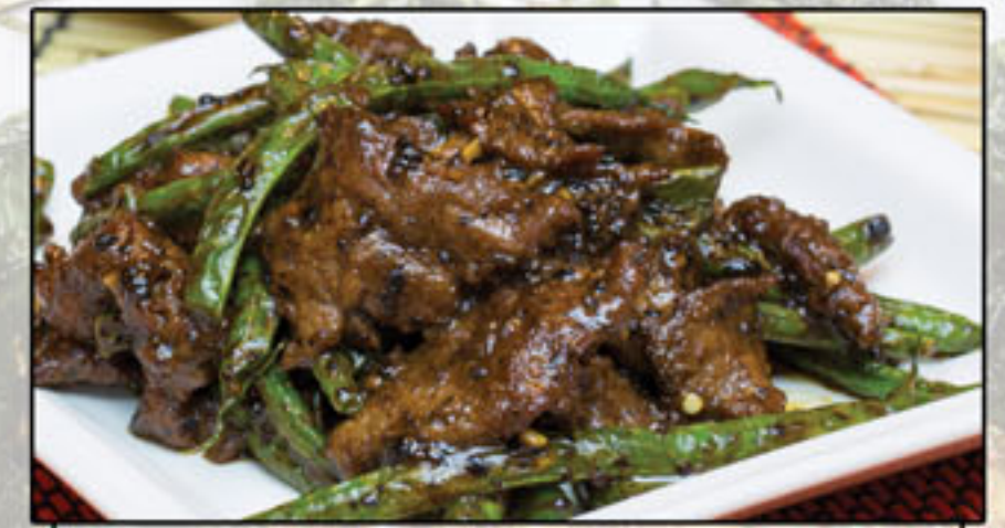
豉汁牛肉 Beef with green bean in black bean sauce