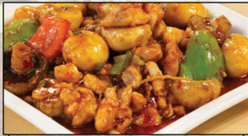
魚香雞丁 Chicken with chili and garlic sauce