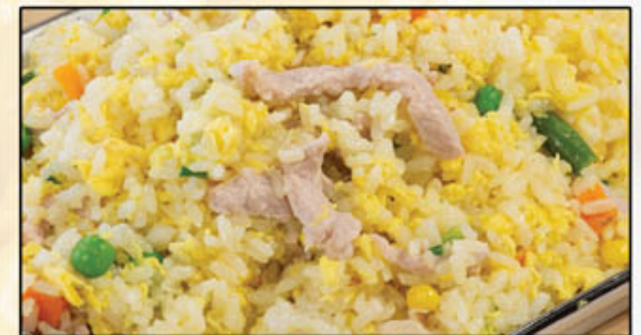
肉絲炒飯 Pork fried rice $11.99