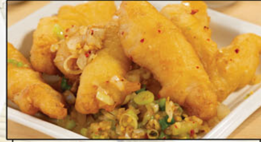
🌶️ 椒鹽魚柳 Salt & pepper fish