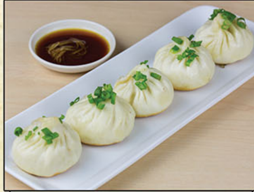
生煎包 $7.49 Pan-fried pork buns