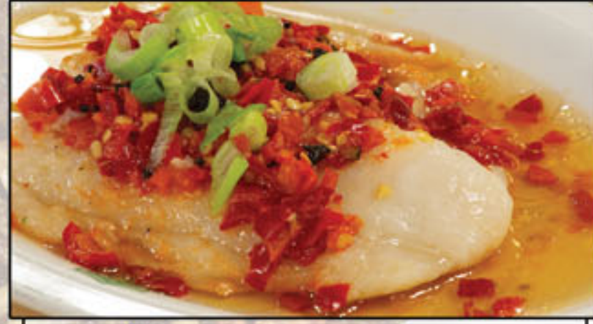
🌶️ 剁椒清蒸魚 Spicy steamed fish