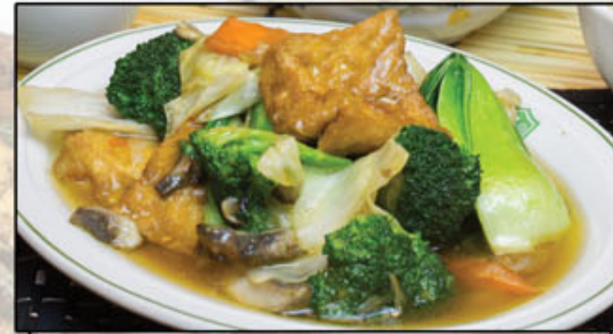
青菜豆腐 Mixed vegetables and tofu