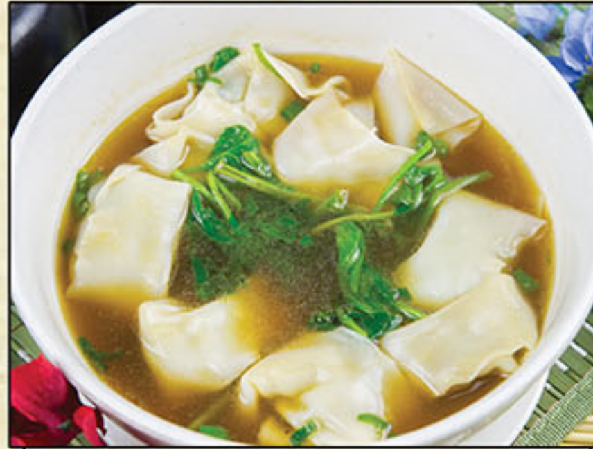
菜肉雲吞湯 $9.50 Shanghai wonton soup