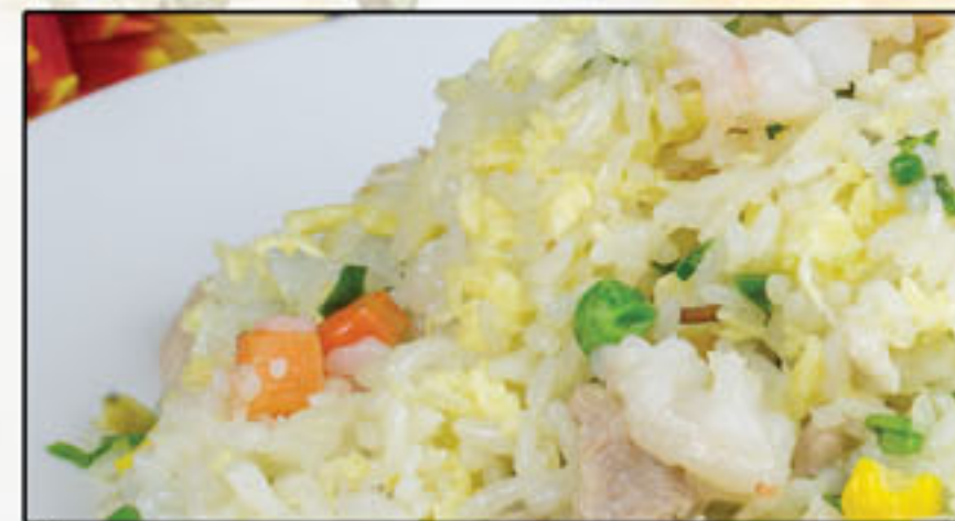
招牌炒飯 House special fried rice $11.99