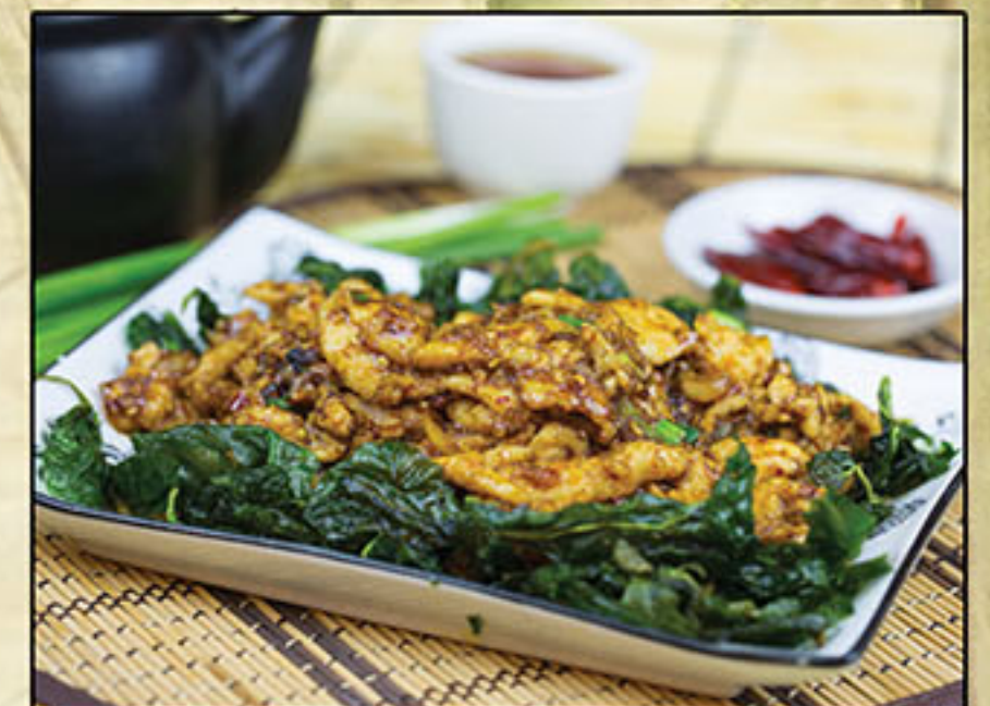
四川雞 $15.99 Szechwan chicken