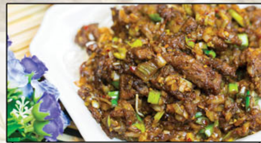
蒙古牛肉 Mongolian beef