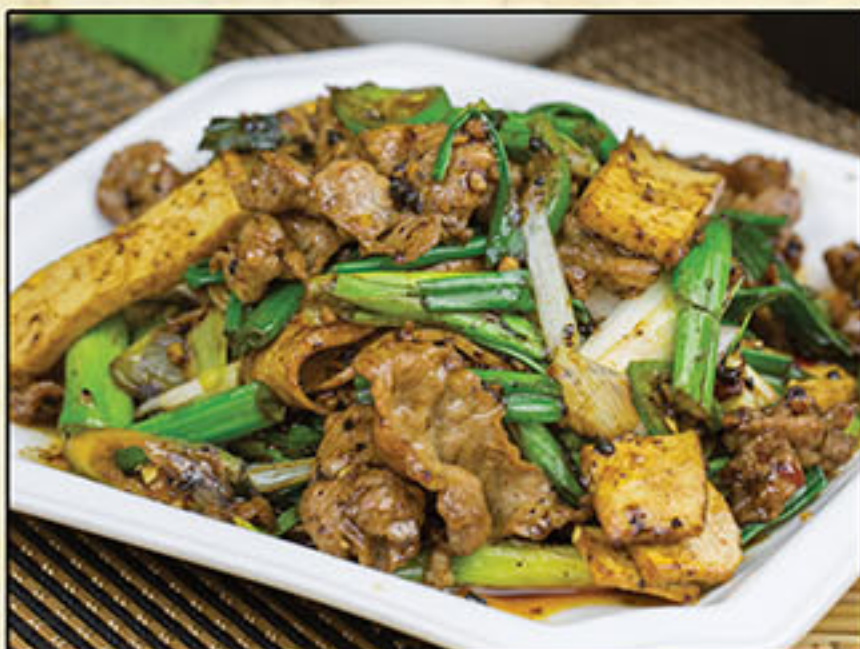
生爆鹽煎肉(辣) $16.99 Pan fried pork with chili pepper