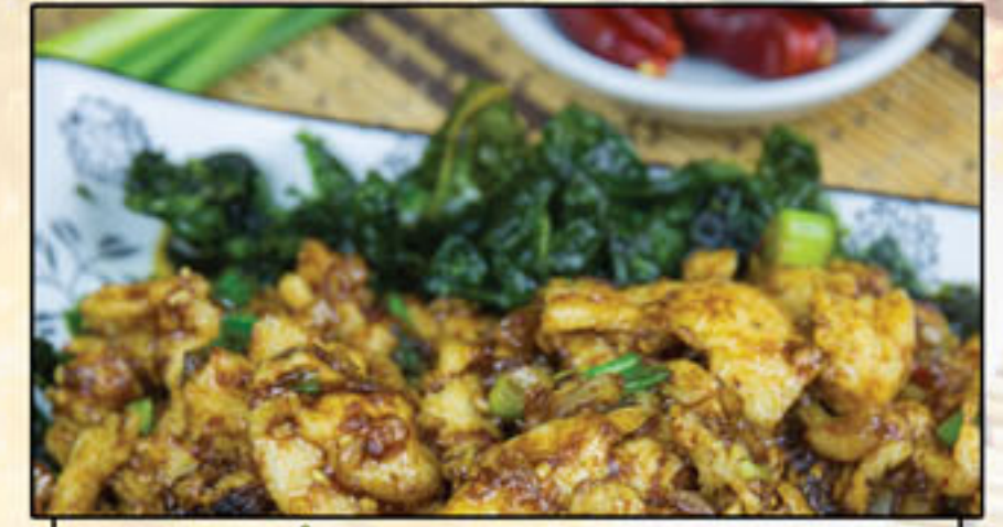
四川雞 Szechwan chicken