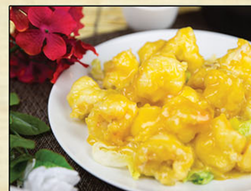
蜜汁大蝦 $20.99 Honey prawn