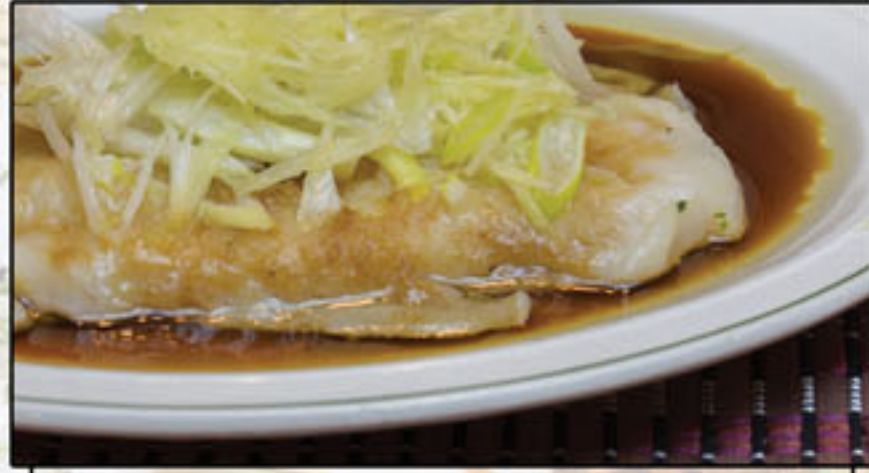
清蒸魚 Steamed fish

以下餐加蔬菜或肉 +$4.00 Add vegetables or meat to below items