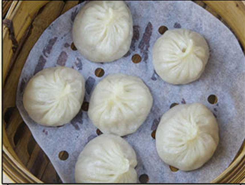
小籠湯包 $6.50 Xiao Long Bao (Shanghai juicy pork dumplings)