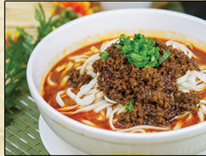
改良擔擔麵 $9.50 Tan Tan noodle soup with minced meat