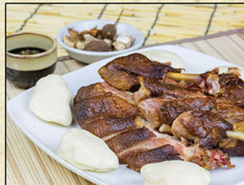
樟茶鴨 Tea-smoked duck 半只half $17.99 全只whole $35.00